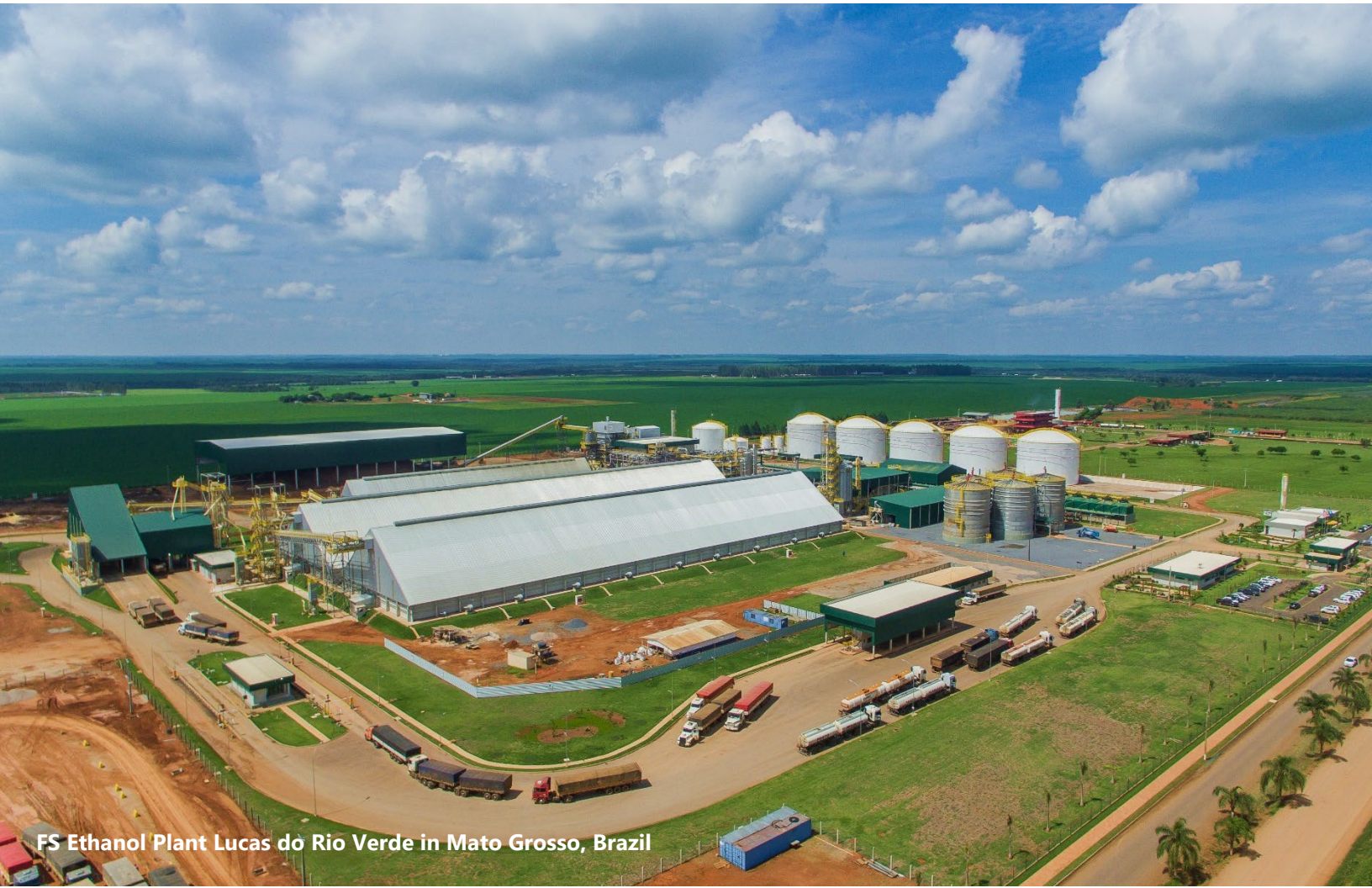
FS Ethanol Plant Lucas do Rio Verde in Mato Grosso, Brazil